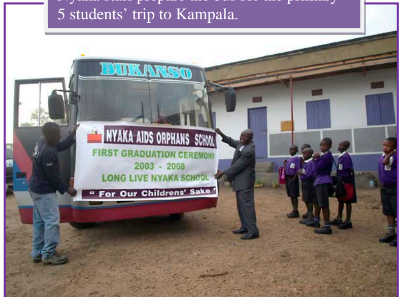
Nyaka staff prepare the bus for the primary 5 students' trip to Kampala.

In order to enhance the academic experiences of the students, build confidence and self-esteem, and breed dreams and excitement about the future, students in the upper levels of Nyaka have had several educational excursions throughout Uganda. In 2008 uprising student to primary 6 took a trip to Kampala (the capital of Uganda) and Entebbe. They visited the Makerere University campus, several historical sites including the Kasubi tombs, the zoo, and toured the cities. Often these trips are the first time the students have travelled outside the village and especially the first time they have travelled to a big city.