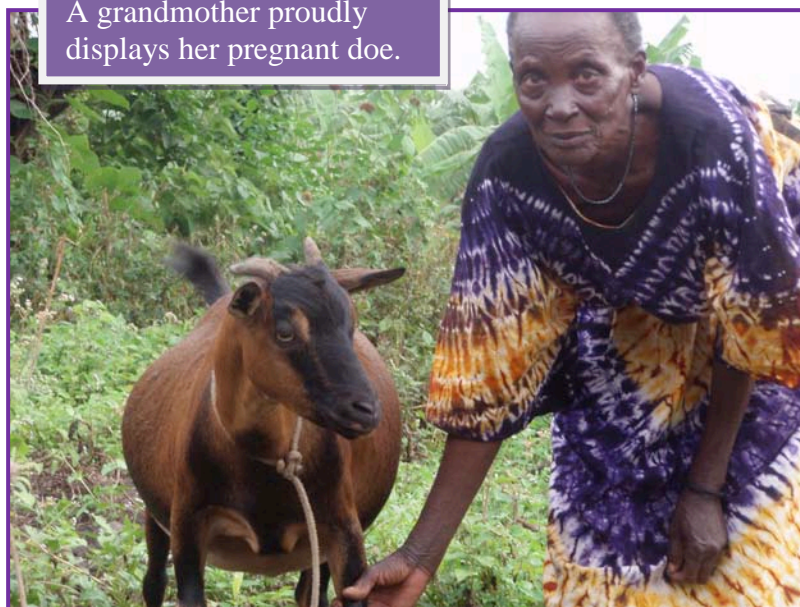
A grandmother proudly displays her pregnant doe.

Improvement of grannies standards of living.