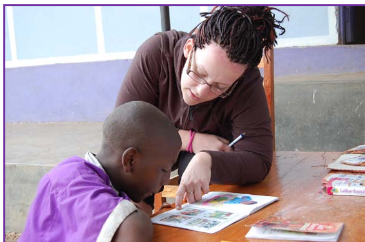
A volunteer from Prince Edward Island University and an Nyaka student work on English together.