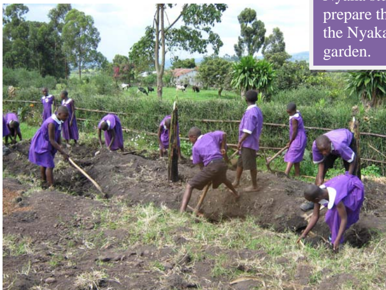
Nyaka students hand prepare the fresh soil for the Nyaka school garden.