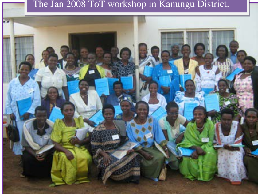
The Jan 2008 ToT workshop in Kanungu District.

trained Trainers with the aim of mobilizing grannies at the grassroots level into networked parish self-help groups. We held another ToT in Sept 2008 for the grannies at Kutamba. The issues discussed in these workshops included handling the emotional and physical stress that accompanies carrying for an orphan, raising up orphans in a loving household, handling grief and depression, taking orphaned grandchildren for HIV testing as well as getting tested themselves, and home based care for HIV positive family members. The grandmothers learned how to start up successful income generating projects,