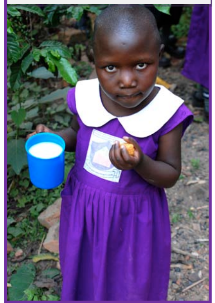
A primary 1 Nyaka student takes her breakfast.

The larger community often suffers from poor nutrition and chronic malnourishment. Therefore, the Nyaka AIDS Foundation continued building community gardens into 2008. The Nyaka students work with their guardians at the school garden and are able to take produce home. Normally it would be possible for guardians to grow their own vegetables. However, many do not have the land, and land is very expensive to purchase.