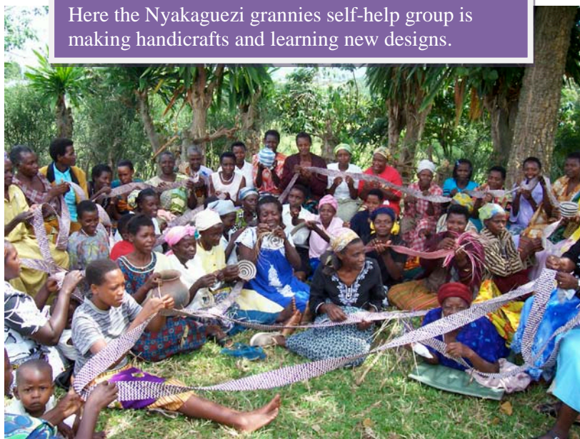
Here the Nyakagezi grannies self-help group is making handicrafts and learning new designs.

Before Nyaka grannies project started, very many grannies had no domestic eating or cooking utensils. Once the grandmothers had mobilized into groups of women they knew and trusted they began to pool funds at their monthly meetings. The groups have taken these small funds and used them to purchase necessities in bulk at a lower price per item. Then they have distributed the utensils to the grannies that have contributed. For example, in 2008 the grannies groups were able to distribute plates and cups to 203 granny families in the sub-county of